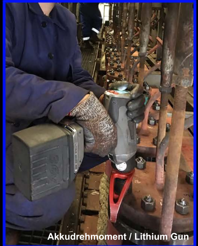
Akkudrehmoment / Lithium Gun